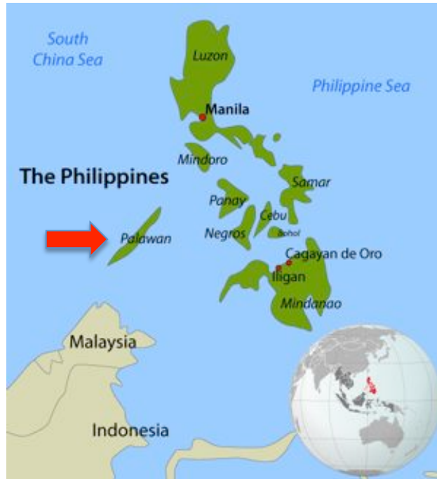
Map of the Philippines

Buenavista: Buenavista village is located 50 km. north from Puerto Princesa, the capital of the province of Palawan. The village has around 200 households. The main livelihood activities are fishing and farming.