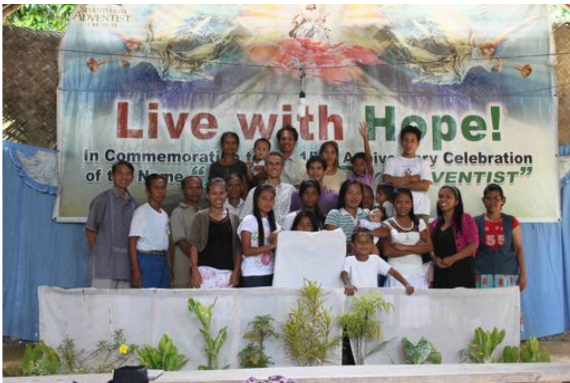
Members of Buenavista Church.